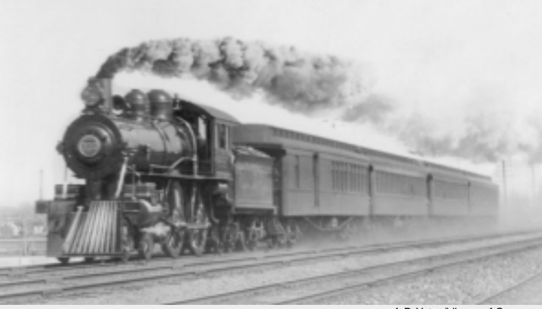
A.P. Yates/Library of Congress