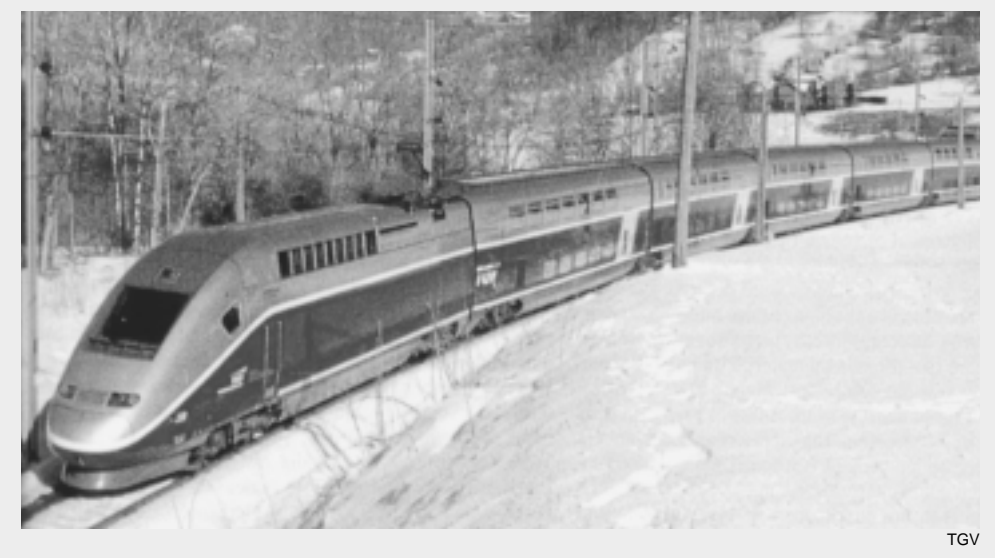
France's TGV high-speed electric train. Nearly 80 percent of France's electricity is supplied by nuclear energy, and supports its nationwide grid of electrified railroads.

The steam-powered locomotive, an invention of the 1820s and 1830s, works on the following basis: On the locomotive of the train is a "firebox" into which coal is